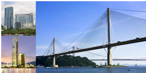
Langham Place; Nina Tower; Tsing Kau Bridge - Hong Kong

7 World Trade Centre Reconstruction at Ground Zero New York City