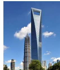
Shanghai Financial Centre Tower