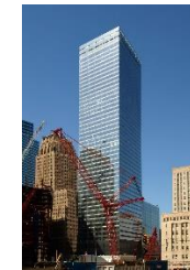
World Trade Centre Redevelopment – NYC