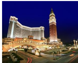
Venetian Casino- Macau